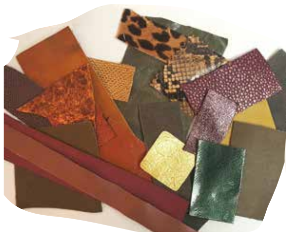
Deep Earth Tones & Animal